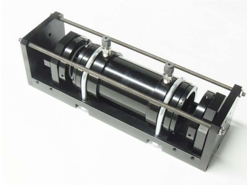
OELPC-100 Gas Cell with built-in isolated chamber